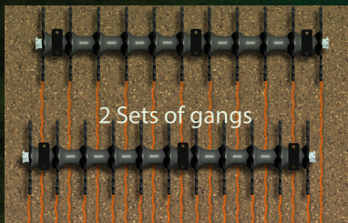
2 Sets of gangs