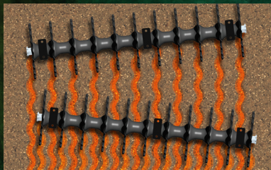
6 DEGREE GANG ANGLE